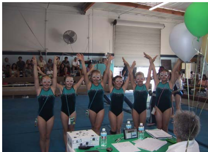
Gymnasts saluting with $$ Glasses

This was not just another meet! The fun and non-competitive format allowed gymnasts to perform their routines and receive scores from judges – but rather than competing against others for medals, they earned “Gym Bucks.” All gymnasts started out with a wallet and 5 Gym Bucks. At each event, they earned a number of Gym Bucks corresponding to their score. In addition, they could earn “Credit Cards” for exceptional performance on a